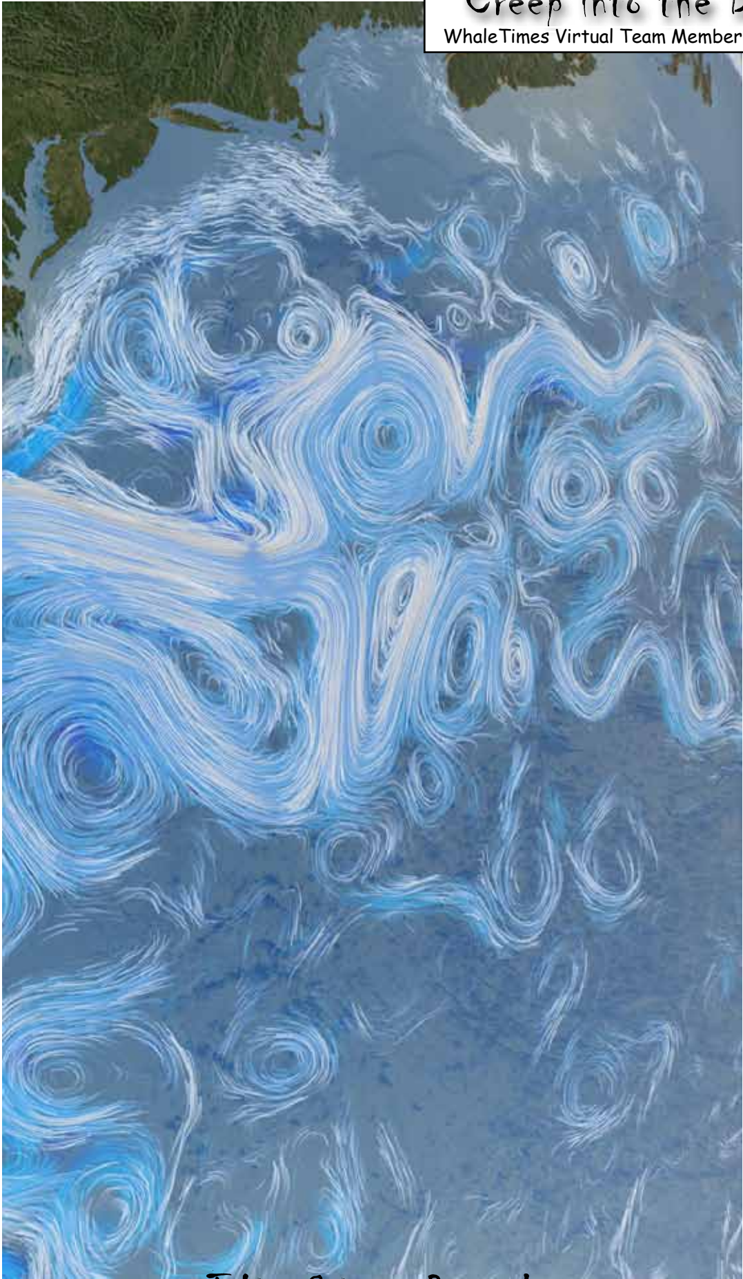
NASA-created image of wind-created surface currents off the coast of Florida.