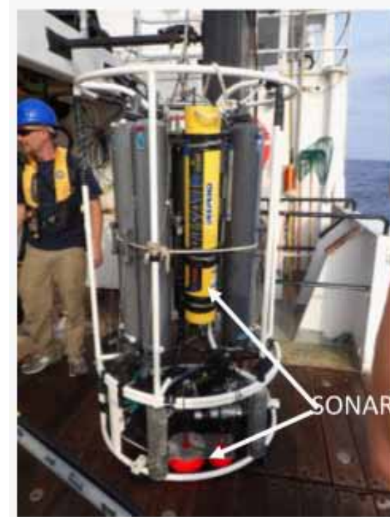
Figure 2: The autonomous echosounder system attached to the CTD rosette to collect data within the mesopelagic layers.